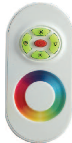
RF remote control unit which eliminates the need for an Infra-red eye.

Like all our range, this light source is undergoing constant improvements and upgrades, so we reserve the right to alter specifications as required. UL approval for this model is currently being processed.